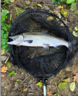
North Coast Tributary Salmon